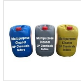
Multi Purpose Cleaner