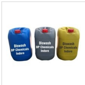
Dish Wash Gel